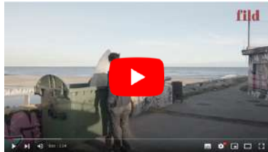
French FILDMEDIA (FR) reportage)