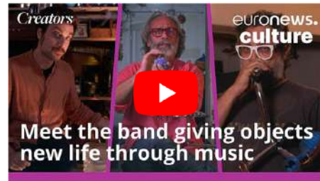
EURONEWS.Culture (ES sub EN)