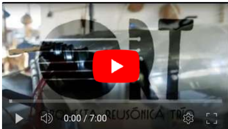
Video EPK 7 min (ES sub EN). Teaser Video 1 min (ES sub EN).