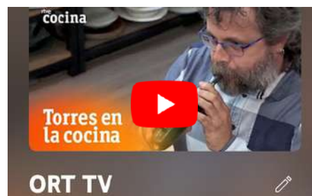
Musics ORT musicians on TV, TEDx y WEB (13 videos)