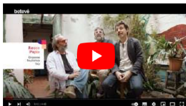
Catalan TV BETEVÉ (CAT) reportage