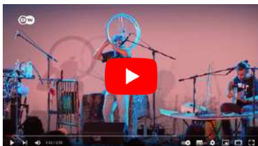
Geman EUROMAXX DW TV (DE) reportage